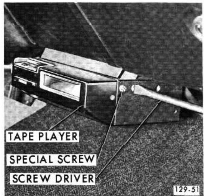
Figure 129-16 Anti-Theft Screw Removal

The 1971 Delco Radio tape player is equipped with a cartridge locking arm to hold the cartridge in a rigid position against the capstan drive for minimum wow and flutter. As the cartridge is withdrawn from the player, the on/off switch at the other side of the cartridge is not completely disengaged when the cartridge lock arm reaches a detent point on the cartridge. Always withdraw the cartridge just beyond the detent point, this will enable normal operation from the radio.